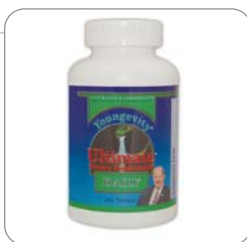
Item# 21831 - 180 Tablets